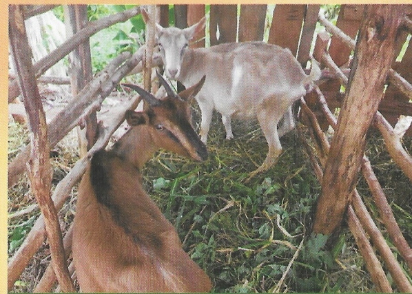
Dairy goat farming