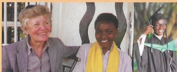
Faith graduates with a degree in pharmacy