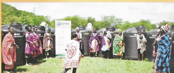
Supporting women with tanks for rain water harvesting