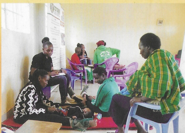
Support for children with special needs