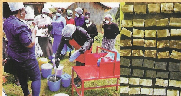
Handmade herbal soap by women