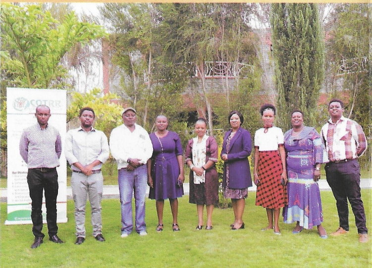
COTRR field, project and management team

The projects and programmes are run in partnership with a local Kenyan non-governmental organization;- Community Organization & Training for Risk Reduction (COTRR)