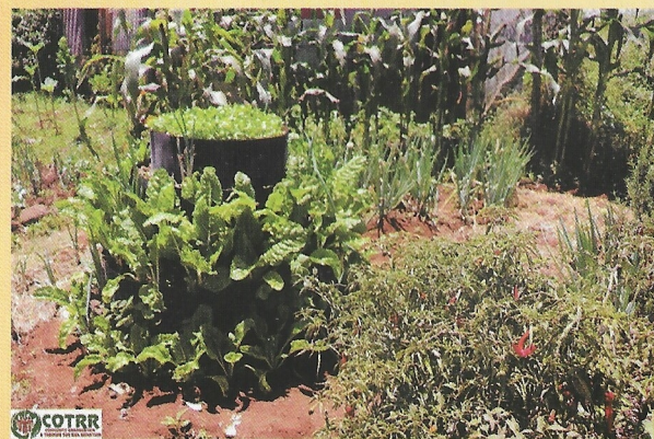
Wonder multistorey garden for nutrition support