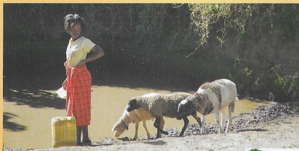
Community water source - Suswa